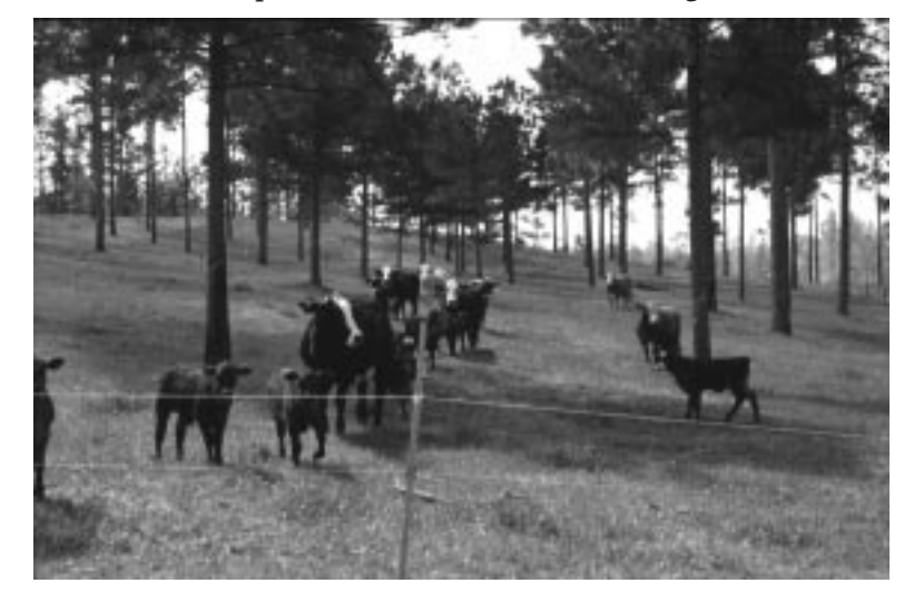
Cattle\ graze\ in\ a\ silvopasture\ with\ loblolly\ pine\ at\ the\ Hill\ Farm\ Research\ Station\ near\ Homer,\ LA,\ a\ featured\ stop\ on\ the\ 6th\ Agroforestry\ Conference\ field\ tour.

fluences both timber and forage production. Reducing the number of trees, altering the spatial arrangement of the trees, and manipulating canopy size can control the competitive impact of the tree crop. Since the study area contains six different tree-age classes, five types of spatial arrangement and an array of pruning options, the impact of